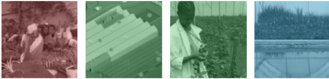
WOMEN EMPOWERMENT 2

FSI members are driving improvements on key sustainability topics through the implementation of field and research projects. Projects are co-funded by IDH The Sustainable Trade Initiative. Results are shared and used within the network to strengthen practices and ensure progress towards the FSI shared ambition.